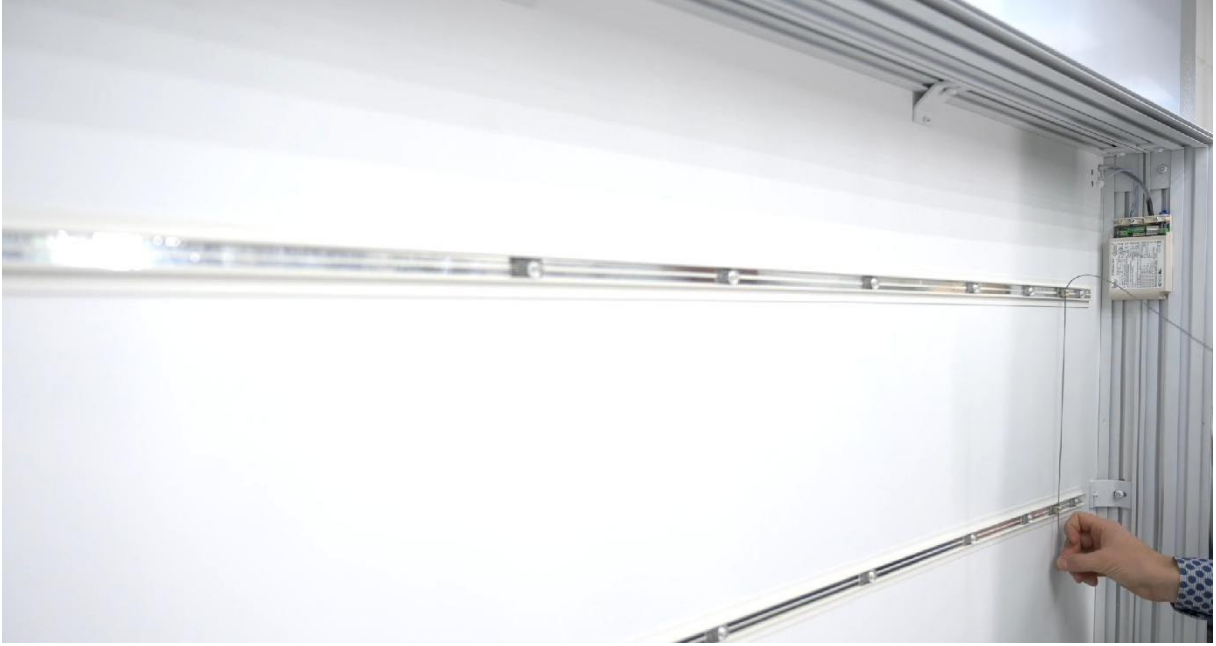
Backlighting to light large surfaces, for example like posterboxes.